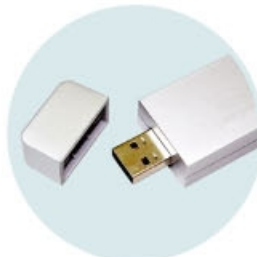
Support Pen-drive / External HDD backup