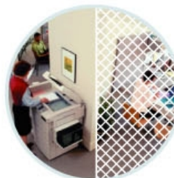
Motion Detection recording