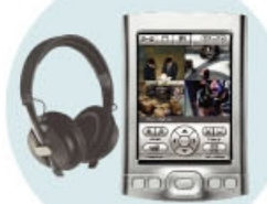
Support PDA Viewer with video & audio