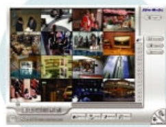
Support Remote Console