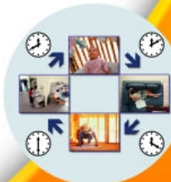
Auto scan set different switch time for each channel