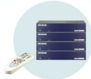
Remote control multiple DVRs without glitch

AVerDiGi EB1304 NET 4CH MPEG4 Real-Time Networking DVR provides multiplex function, user-friendly operation, and the most satisfied price to touch your heart.