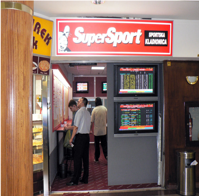
"All of the 327 EB1304NET DVRs work perfectly" says Supersport, enduser customer.

Supersport is the biggest Croatian betting house enterprise who recently applied AVerDiGi EB1304NET at 327 branches to enforce government's law of security regulation. At Supersport, there is a need to fully remote control DVRs from 327 branches to protect both their business and customers. After a two-month field test, Supersport decided to adopt EB1304NET as their surveillance solution. Supersport further commented that no one from 327 EB1304NET DVR which they purchase, had any technical problem in work. All of units work perfectly since installation. Supersport's confidence in our DVRs is yet another prove of AVerDiGi DVR can practically fulfill user's surveillance application. Up to now, we are still having ongoing similar projects for EB1304NET and will continue to provide solutions meeting our customers' needs.