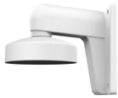
HIA-B401-110T Wall Mounting Bracket