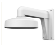
HIA-B401-110T Wall Mounting Bracket