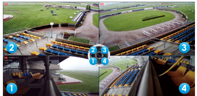
Multiple sensors, Adjustable views